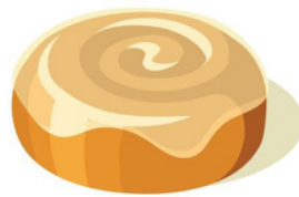
Cinnamon Rolls For Sale to Take Home

Our Savior's Lutheran Church Wednesday, April 15, 2026 11:00 am to 12:30 pm Fellowship Hall